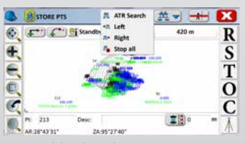
New search icon in top bar