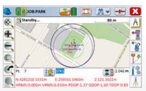
Hybrid+, IMU, Backup Tracking, Open Street Maps